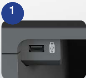
USB direct print*