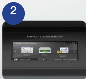
3.7" TFT Colour LCD*